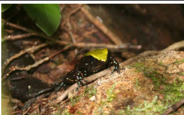
many little green and black frogs (the guide gave me its scientific name, but I can't remember it),