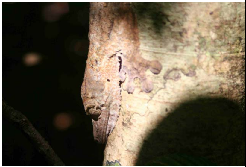
a leaf-tailed gecko,