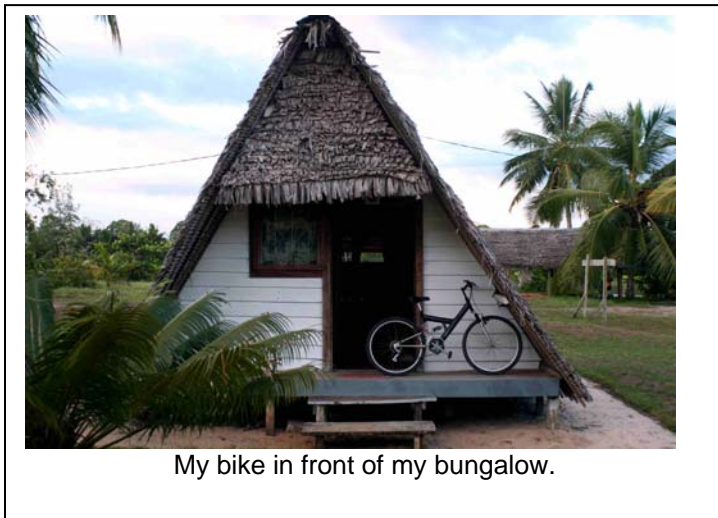
My bike in front of my bungalow.

While in Maroantsetra I bought a relatively nice Italian mountain bike for about $30. The “streets” are sandy with some patches that were paved about 20 years ago. It is excruciatingly hot here, so getting around by bike cuts travel time in half and I sweat just as much as if I were to walk. I got sunburned after having my arm out a car window for 15 minutes. I also have been buying the baskets here. Many of them are made in this area and they are very cheap and irresistible. I also bought two used tank tops today. I only brought one to town plus all of my field clothes. All of my field shirts are long sleeved to avoid biting things in the forest.