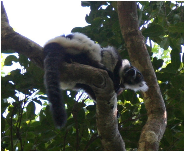
We saw Varecia variegata variegata , ie. the black and white ruffed lemur,