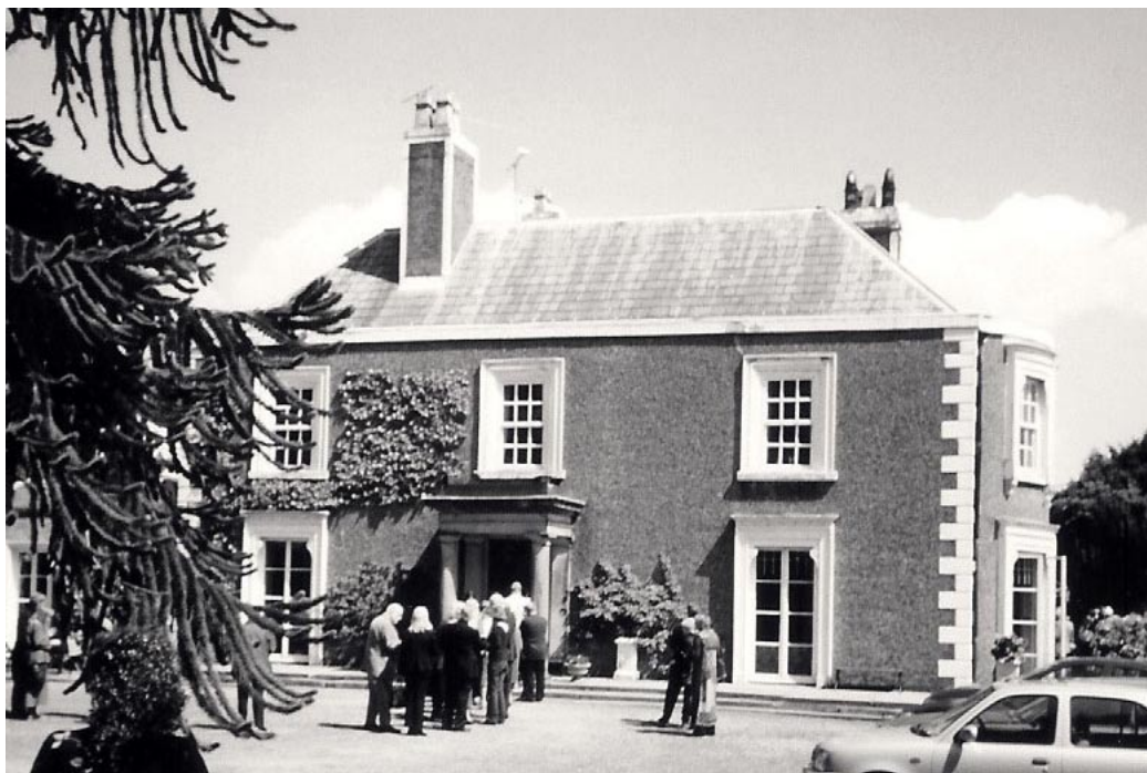
Mourners at Poulton Hall