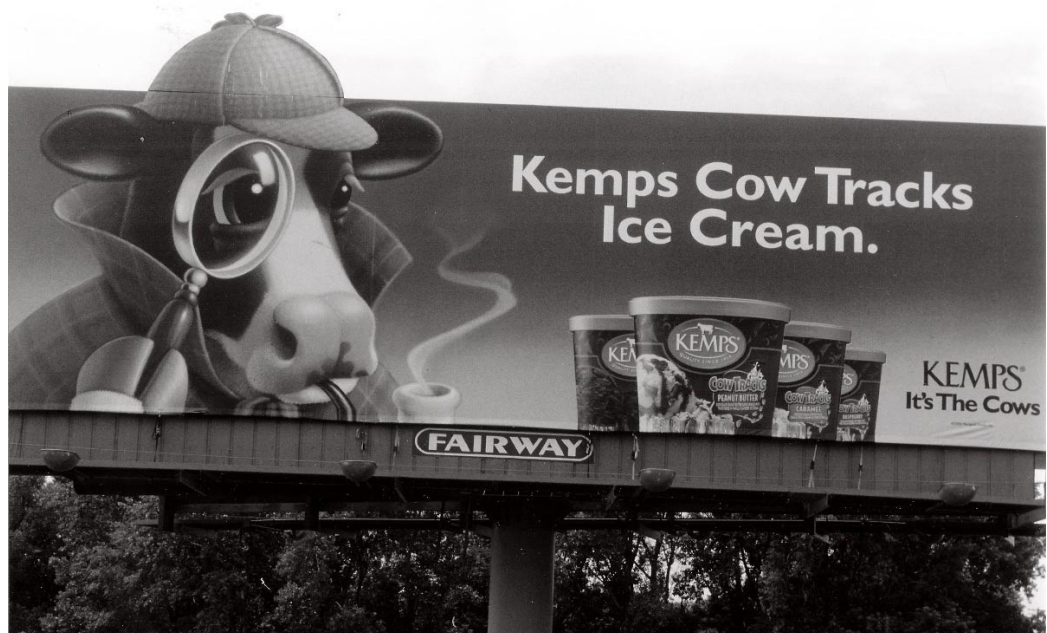
Our members from outside the Twin Cities may be interested to see this photo of a billboard that has been in rotation alongside major highways in the metro area.