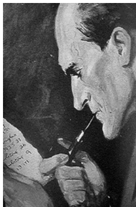
After the May session, the Study Group recessed for the Summer.

"Brain fever" is a common malady in the Canon, yet our medical experts advised us that there is no such affliction, although some real diseases may resemble it. Though brandy was dispensed, it was not effective in this case. Phelps was nursed by Annie Harrison, his fiancée. Holmes declares Miss Harrison to be "a woman of rare character" after studying her handwriting. Holmes later places Phelps's fate entirely in her care when he leaves her to guard the room where the treaty was hidden. It would be a stretch to imply that Holmes was romantically taken by Miss Harrison, but she received